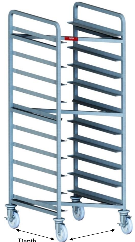
Shown with optional donut bumpers