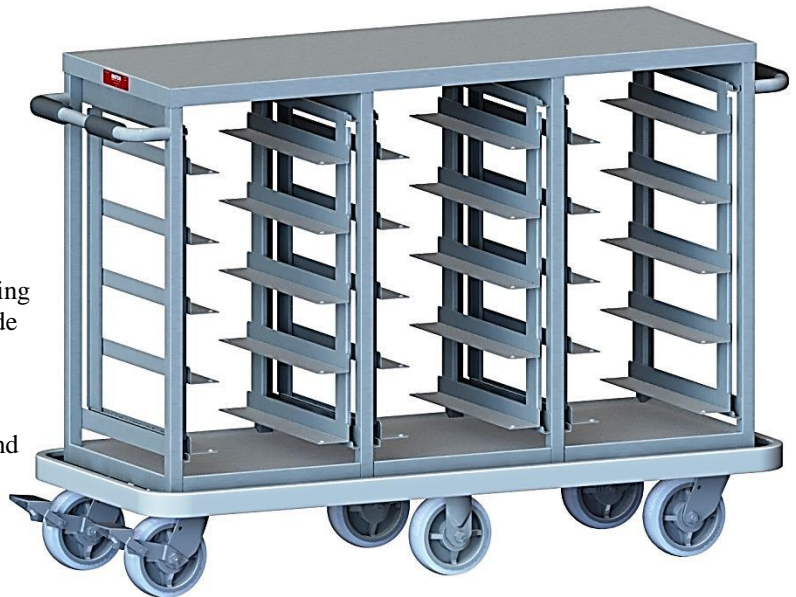
Shown with optional centre casters