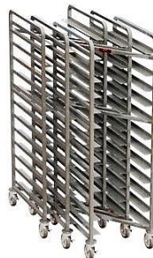
Nested carts shown